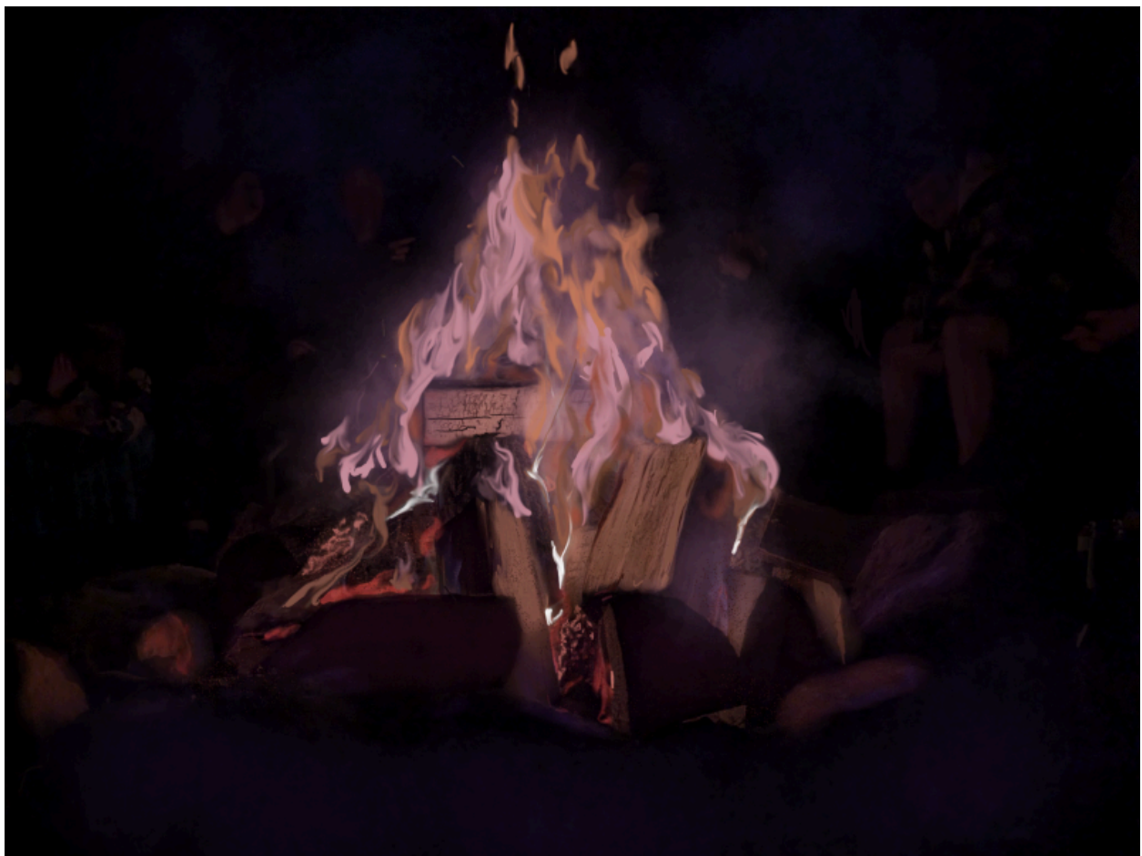
Artworks provided by Epistle Committee to accompany the Epistle.

Building a community takes time and effort and often mistakes are made. We are left feeling nourished that we created a space that friends felt able to share with each other individually and through ministry. With new light in our hearts we are going back to our homes and lives, feeling encouraged to live our faith in practice, already looking forward to our next meeting.