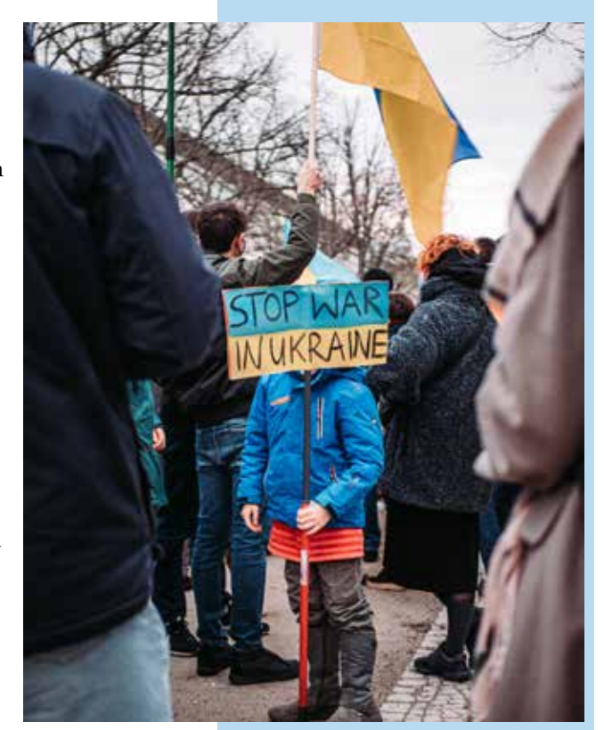
A child protests against the invasion of Ukraine.

Nadyezhda Ivanovna Spassenko, Ukraine, 15 March 2022