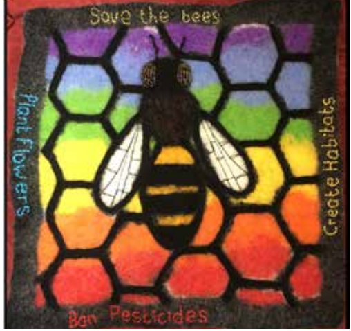
A panel from the Loving Earth Project.

contact points from within your Quaker community.