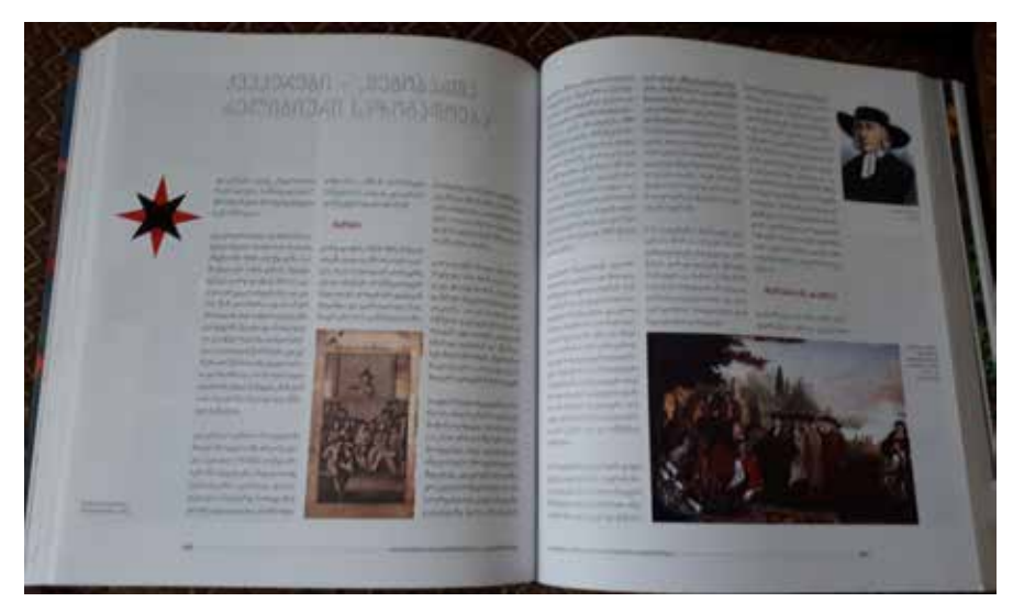
Part of the feature on Quakers

illustrations about Quakerism in the encyclopedia. The chapter about "Quakerism" in the book describes the history of Quakerism, faith and practice, social service, organisational structure and history of Friends in Georgia. It also includes interviews with the current and