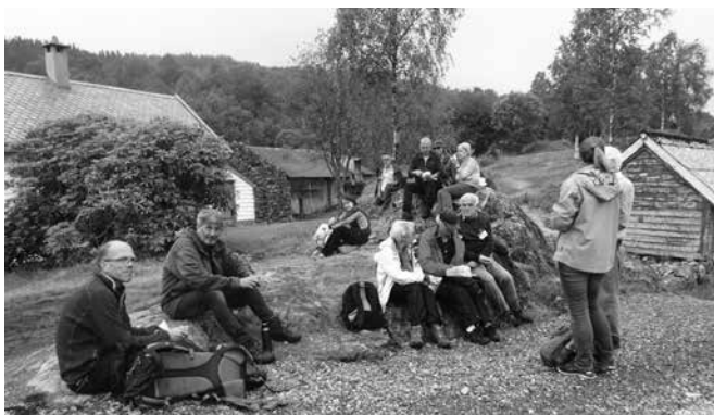
A rest on an energetic hike in free time