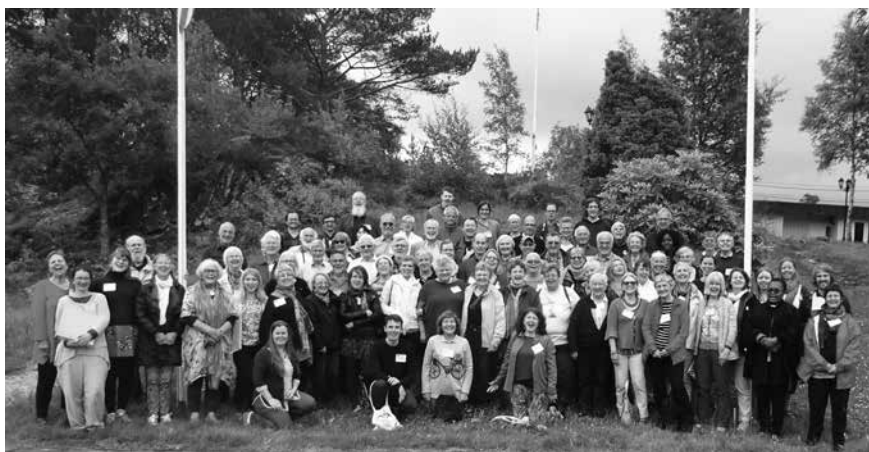
EMES Gathering in Bergen

With three former secretaries and two former clerks also present at this very special gathering, which celebrated the 80th anniversary of the European section of FWCC,