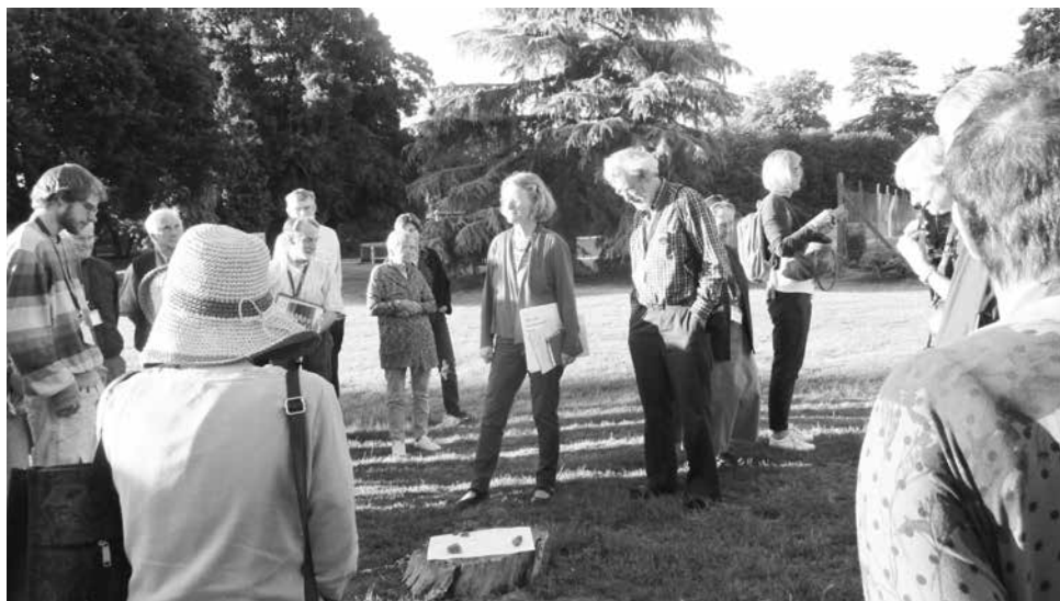
Church and Peace conference