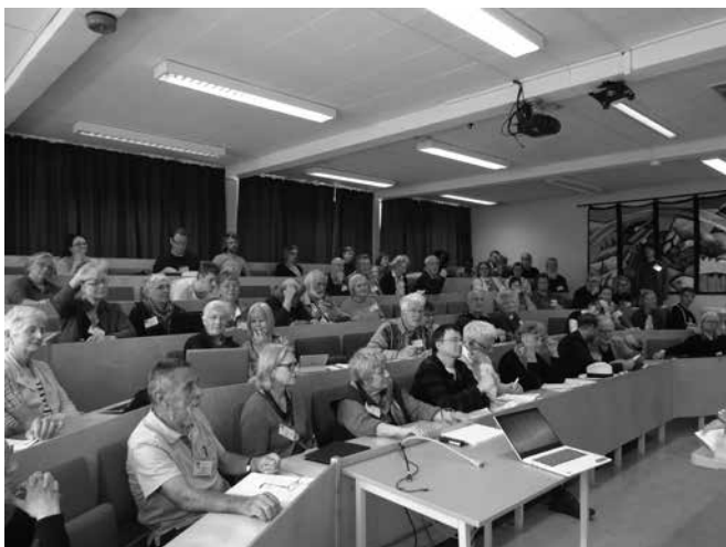
European and Middle East Section of FWCC in session

We hope you enjoy these photos.