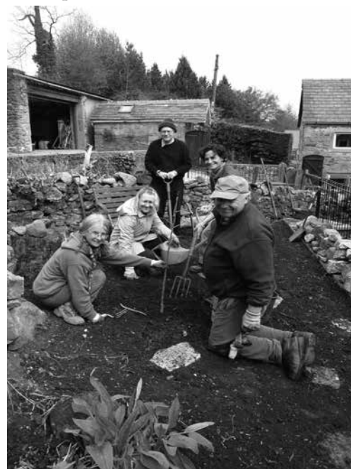
Gardening at a QVA working retreat at Airton Meeting House

A study tour and encounter programme in and around Ramallah, Jerusalem and Tel Aviv supporting community activities including the olive harvest, planned in collaboration with Ramallah Friends Meeting. A unique opportunity to learn about the region.