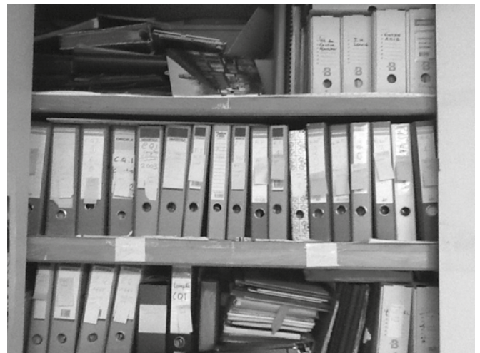
A 'Work-In-Progress' snapshot

So I come back to my question: has your country's collection (or collections) already received such treatment? Have you perhaps transferred your archives to an approved (non-Quaker) place of deposit? Do you have advice for us in France? Would it ever be possible – or desirable - to combine lists of Quaker holdings across EMES Europe? What about long-established and newer worship groups – are you beginning to store your archived minutes and other material? Can experts in Britain YM and Ireland YM offer guidance beyond the help we have already received? Does anyone know of funding that can be accessed? And finally, does anyone want to come over to Paris to see what is stored there? Friendly visitors are always welcome if you let the Centre know beforehand.