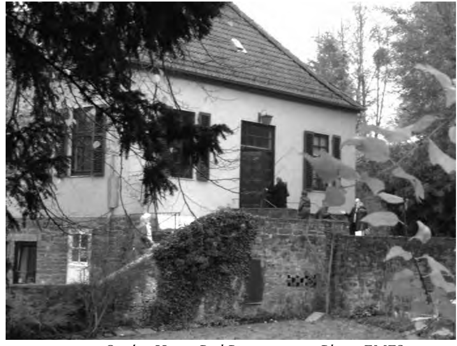
Quaker House, Bad Pyrmont