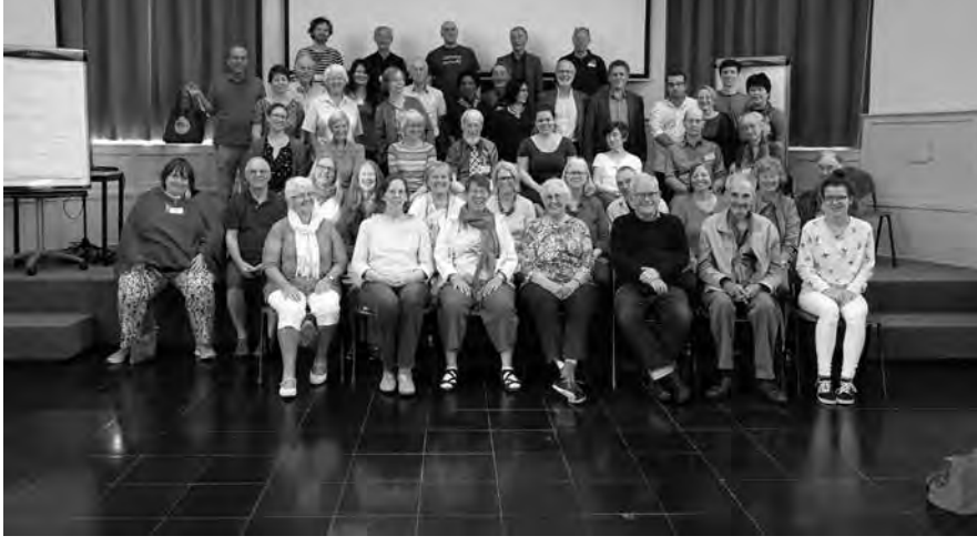
Quakers Without Borders

To celebrate the 60th Anniversary Border Meeting in continental Europe, sixty-three Friends and Young Friends from continental Europe, Great Britain, Ireland, the Republic of Georgia, and Russia, and one non-Quaker invited speaker gathered together at Maison Notre-Dame du Chant d'Oiseau, B-1150 Brussels, Belgium from Friday to Sunday 1 - 3 September 2017 and progressed during the weekend