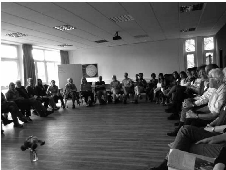
European Border Meeting