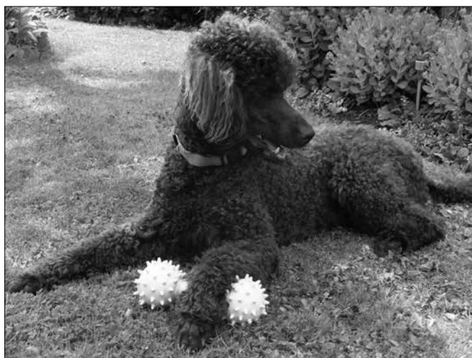
The 'extraordinary' member in the garden July 2014

Feeling adventurous, the expanded little group planned its first Meeting for Worship in Värnamo on January 6th 2011 – Epiphany. As luck would have it, a snowstorm raged in the county on that day, which led to each of