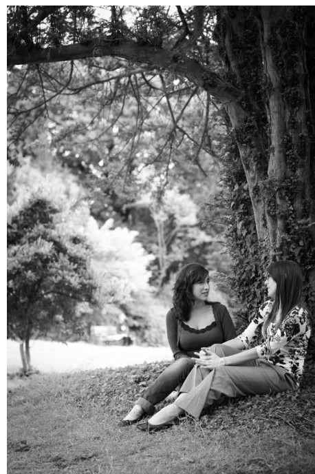
Chatting & relaxing in the Woodbrooke grounds

If you would like to find out more, contact our Educational Administration team at off-site@woodbrooke.org.uk .