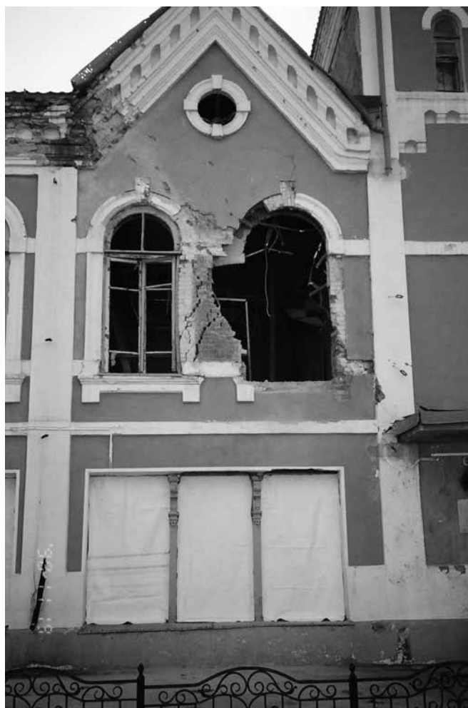
Damage to a Church