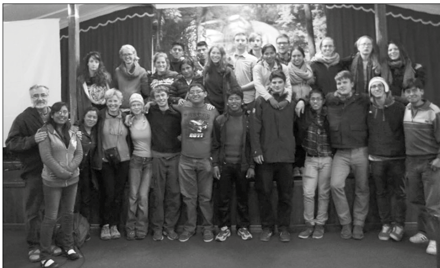
Quaker Youth Pilgrimage

We have found a home away from home within each other. Everyone quickly became integrated in spite of