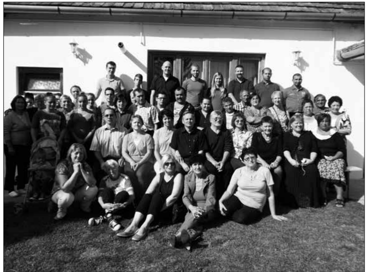
EFCI Europe Conference, Tolna, Hungary

Different locations, different landscapes, different languages, cultures, architecture, food – experiencing such diversity was an intensely rich blessing, and led me to reflect on the meaning of it. Surely, a tree is a tree, and a flower is a flower. A bird is a bird, and a cat is a cat – yet creation seems to have an extravagant abundance of different types of tree, flower, bird, cat etc. And even within each type, the individual specimen is unique, recognisably different from all others. Each and everyone of us has fingerprints that are unique and distinguish us from every other human being on the planet.