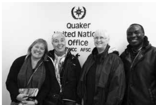
QUNC New York members

Secretary-General Ban Ki-moon launched an exciting new initiative, Human Rights Up Front, in November.